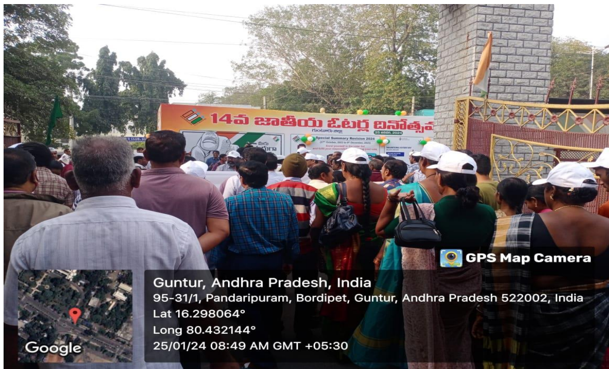
At Guntur Collectorate