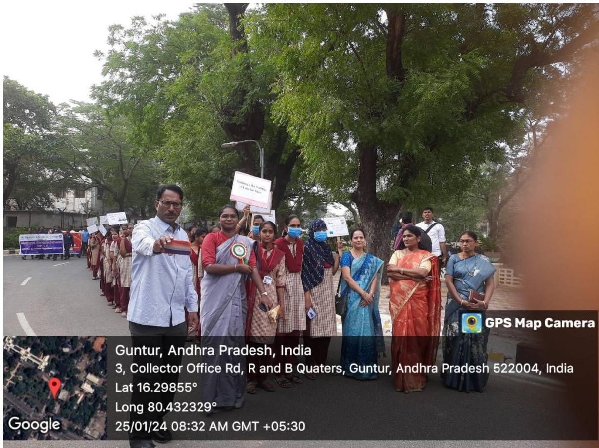
Voters Day Rally from Naaz centre to Collectorate on 25-01-2024