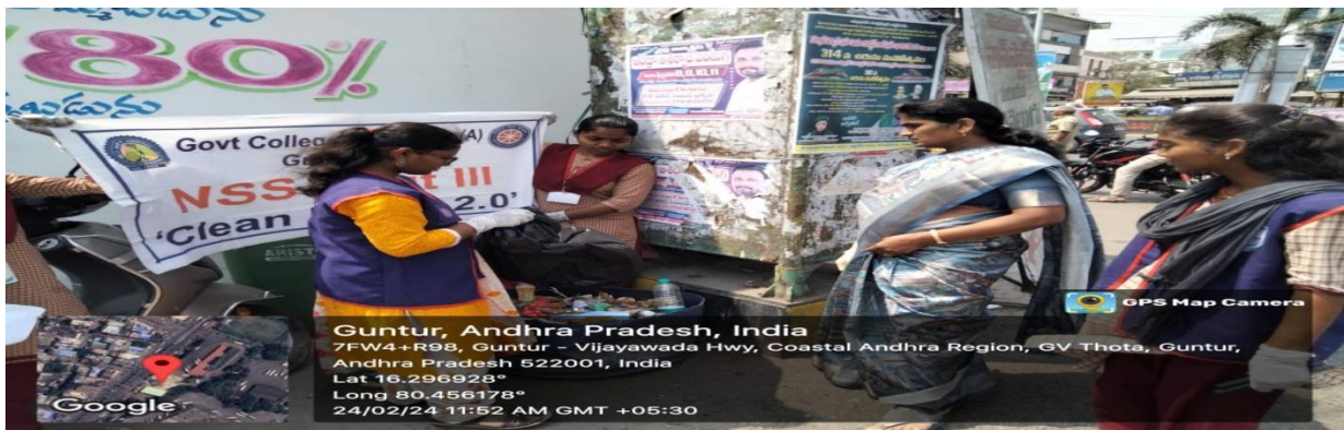
Students Participation and cleaning the RTC Bustand area