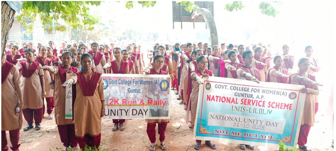
Pledge in the College

The "National Unity Day" Rally organized by GCW(A), Guntur, facilitated a meaningful expression of solidarity and unity among students, faculty, and staff, contributing to the promotion of national integration and harmony.